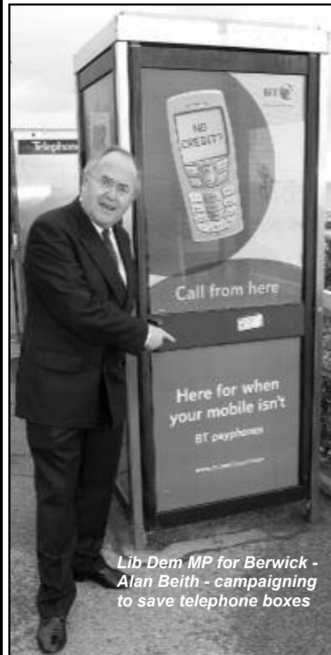
Lib Dem MP for Berwick - Alan Beith - campaigning to save telephone boxes

Alan Beith has called on BT officials to explain the proposed phone box cuts in a face-to-face meeting.