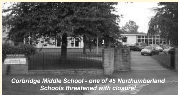
Corbridge Middle School - one of 45 Northumberland Schools threatened with closure!

At the July meeting of Tynedale Council a Liberal Democrat motion supporting the principle of parental choice was supported by the council. Lib Dems believe that there must be genuine consultation on the County Council's proposals for reorganisation. If a majority of parents want to retain the three tier system with middle schools, then the County should modify their plans.